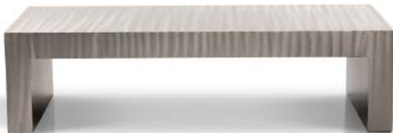
PARIS coffee table