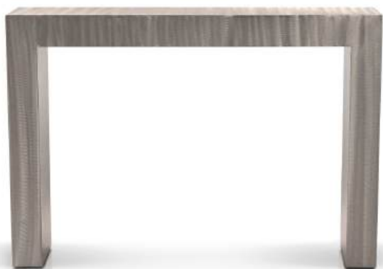
PARIS console table