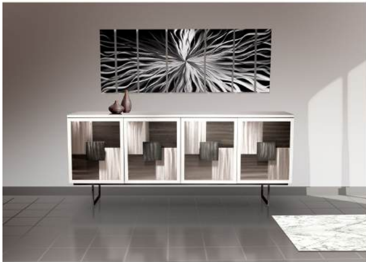
SoHo Buffet Skin Top and Door Inset in #1 Grind / Steel Door Handles in #1 Grind / Diamond Black White Cabinet