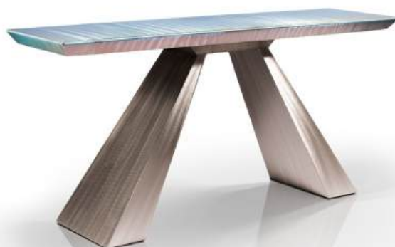
Top in #1 Grind / Steel Blue Base in #1 Grind / Steel