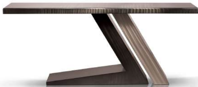
FLORENCE console table