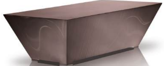
#2 Grind / Shadow