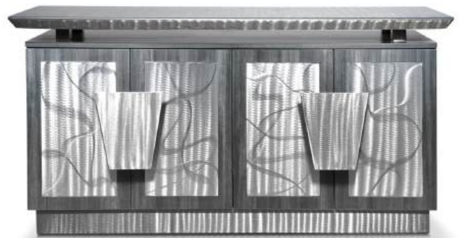
Manhattan Buffet Top, Footplate, Handles in #1 Grind / Steel Door Inset in #2 Grind / Steel Basalt Cabinet