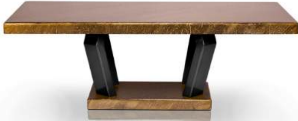
ASPEN coffee table