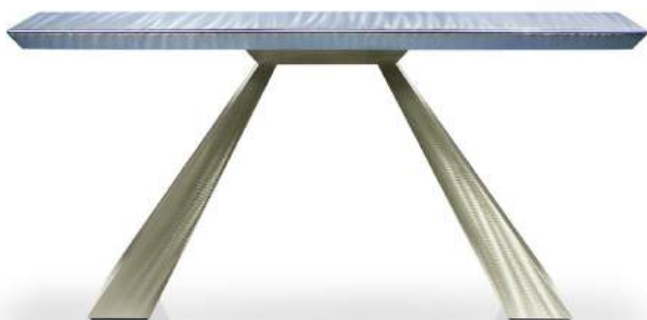
VERA console table