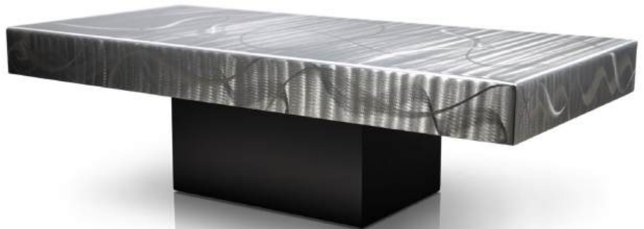
Top in #2 Grind / Steel Base in Textured Black