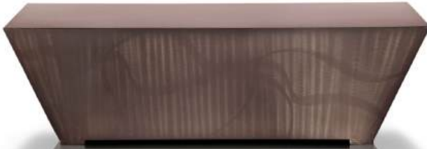
CAIRO coffee table