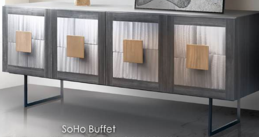
SoHo Buffet Skin Top and Door Inset in #1 Grind / Steel Door Handles in #1 Grind / Champagne Basalt Cabinet