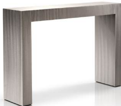
#1 Grind / Steel