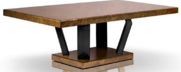
Top and Footplate in Gold Dust Base in Textured Black